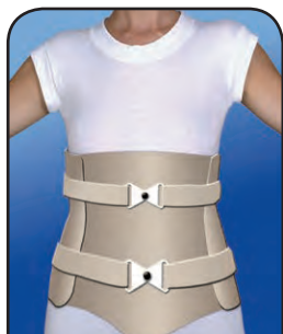
Style 1 With Sleeves