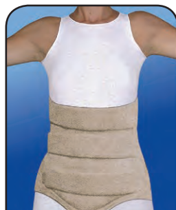
Style 3 No Sleeves