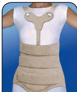
Style 2 Capped Shoulders