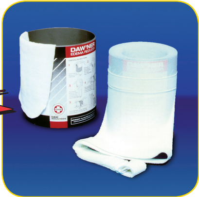
See DAW'NER in Section 1.4B p.01

HIGHLY RECOMMENDED To Apply, Don't Forget to Use the DAW'NER