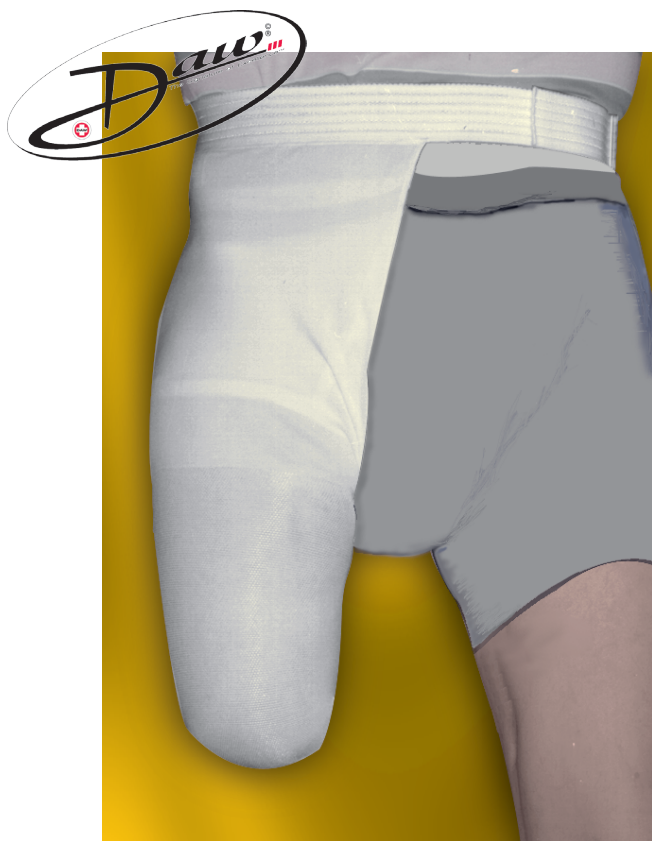
L-CODE : L8460 – Prosthetic Shrinker, AK

PERFECT AK EDEMA REDUCTION IS KIND TO THE STITCHES!