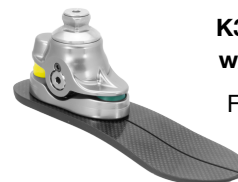
K3 Pro-Action™ Foot w/ Multi-Axial Ankle