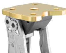
Adult 4-Hole to Pediatric Socket Plate, Aluminum (#: GUPT-F4HROT) Weight Limit: 132bs