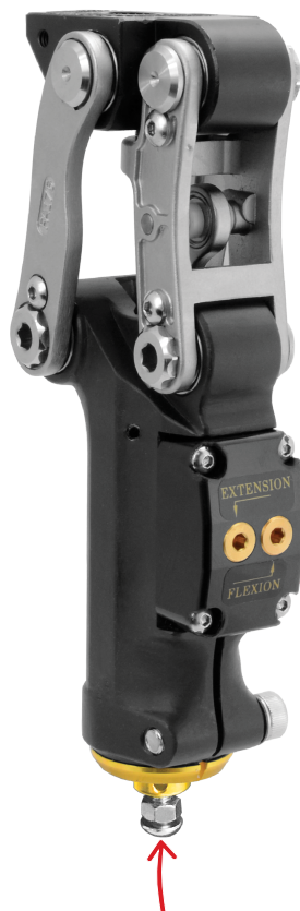
Extension Assist Adjustment

(Complete Adjustment Instructions Can Be Found In This Knee's Practitioner's Manual, Included With Purchase.)