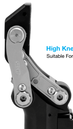
High Knee Center Suitable For KD & PFFD