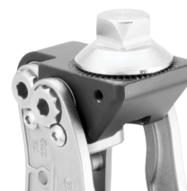
Pediatric Male Pyramid, Stainless Steel (#: GUPAC-MP1) Weight Limit: 132lbs