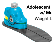
Adolescent K3 Pro-Action™ Foot w/ Multi-Axial Ankle Weight Limit: up to 300lbs