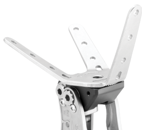
Pediatric 3-Prong KD Adapter, Stainless Steel (#: TSC-KDC-L) Weight Limit: 132lbs