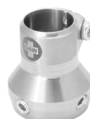
Pediatric to Adult Tube Clamp Weight Limit: 132lbs