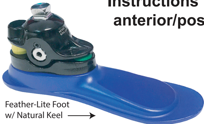
Feather-Lite Foot w/ Natural Keel →